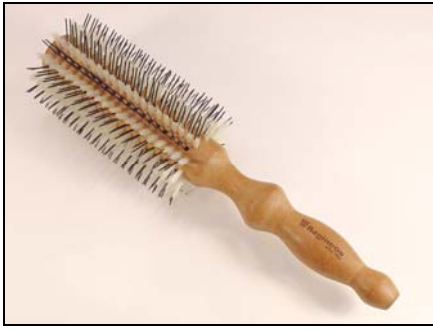
# 50513 – DUO large 63 mm. dia. total 10+10 = 20 bristles rows