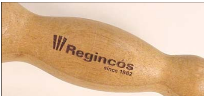
Logo engraved on handle in laser system.

Reinforced blonde bristles and double nylon pins. Mahogany wood sourced from non endangered forests.