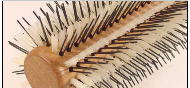
Combination of two different bristles

Sculpted from a high quality polished Mahogany hard wood. The special ergonomic handle with it's added length, gives full control and best salon-comfort in a round brush blow dry. The hardwood absorbs the heat from the blow dry protecting the hair and scalp .