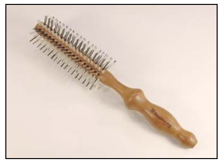
# 50511 – DUO small 45 mm. dia. total 6+6 = 12 bristles rows