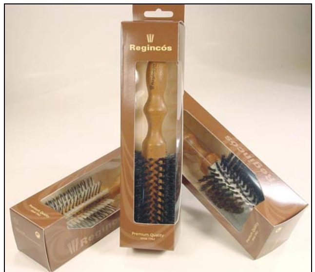
Premium quality DeLuxe box