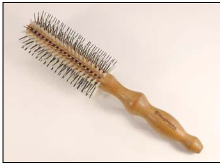
# 50512 – DUO medium 53 mm. dia. total 8+8 = 16 bristles rows