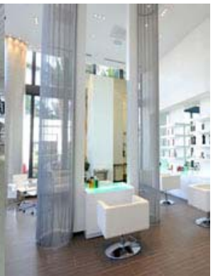
Miami Beach - W Hotel