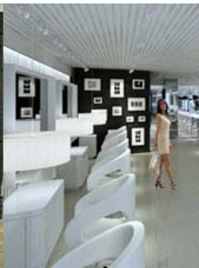
Madison Avenue, N.Y.