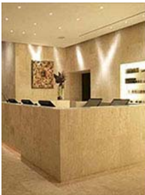
New York - The Plaza